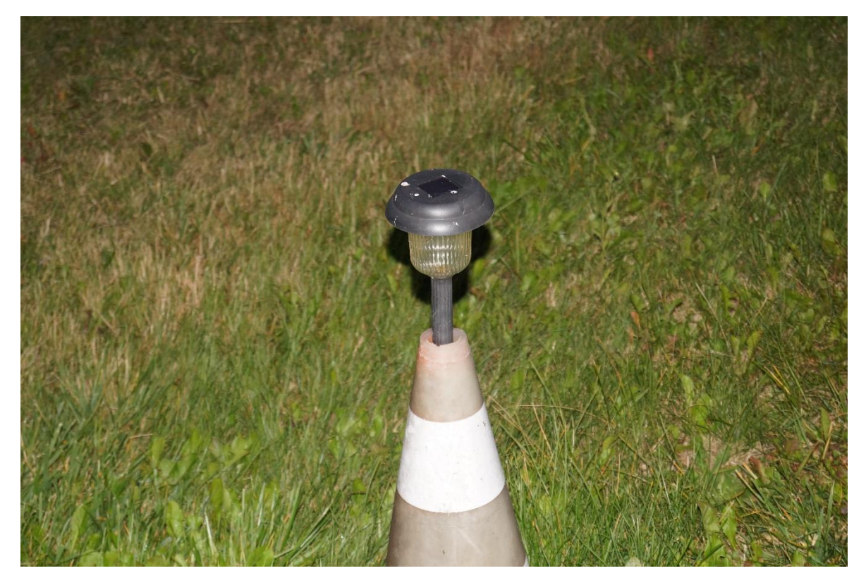
Fig. 6 Solar lamps on the runway edges