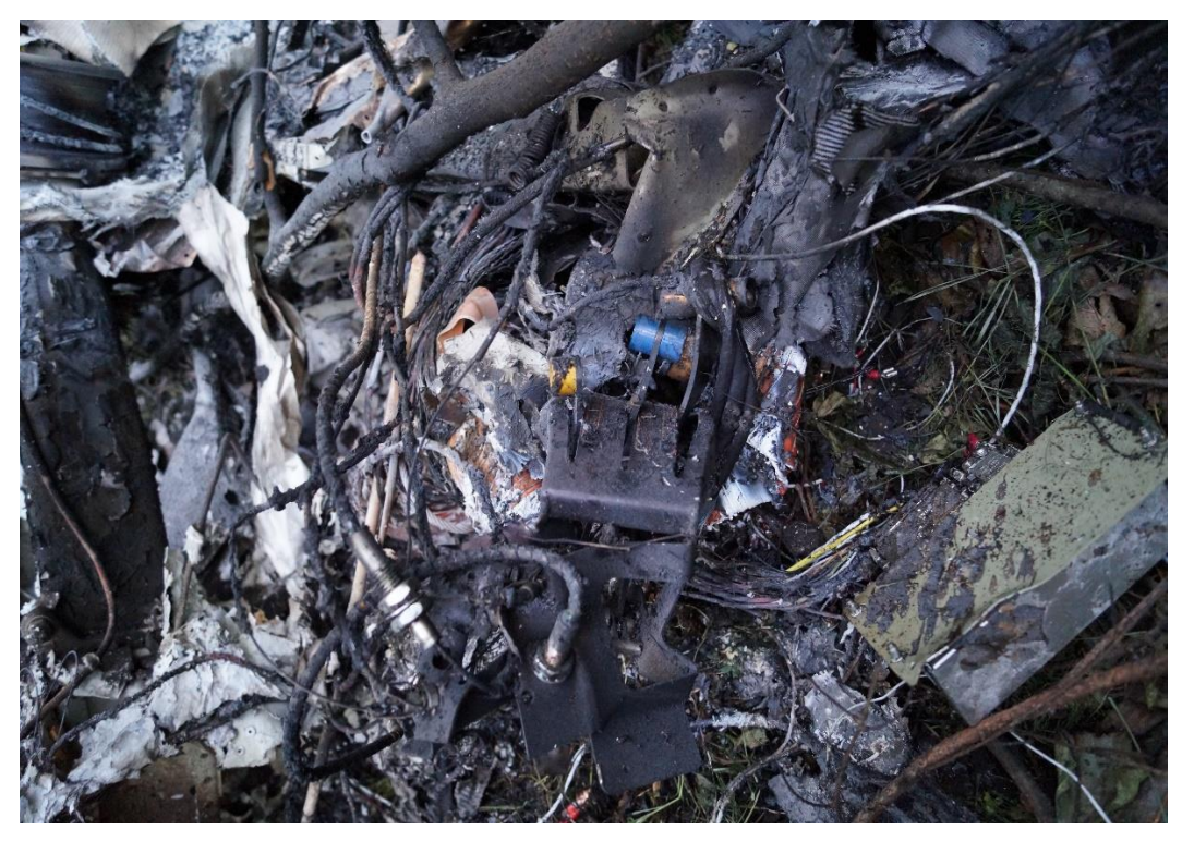
Fig. 10 Engine control system elements found at the occurrence site

During the examination of the wreckage, PKBWL did not find any signs of the aircraft malfunction prior to the accident. However, due to the destruction of the wreckage, it was not possible to completely exclude such a case.