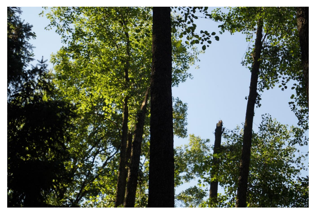
Fig. 9 The area of the occurrence site - treetops cut by the airplane during the collision

During the examination of the wreckage, PKBWL did not find any signs of the aircraft malfunction prior to the accident. However, due to the destruction of the wreckage, it was not possible to completely exclude such a case.