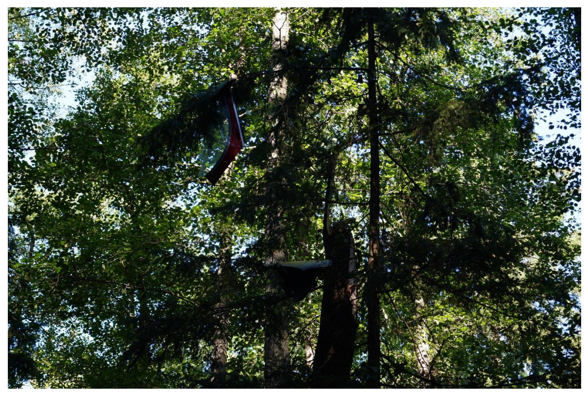
Fig. 8 Detached aircraft elements that remained on trees after the accident

The occurrence site was located approximately 2,400 meters from the threshold near the third turn to RWY 11. On the basis of the inspection of the accident site, PKBWL established that the plane entered a tall forest at a little angle of descent. When the plane collided with trees, several tree tops were cut at a height of about 15 meters and the destruction of the plane began. Some elements of the plane remained in the trees (Fig. 8 and 9). Then the partially destroyed plane collided with the ground, the fuel ignited and a fire broke out. The wreckage of the plane was scattered over a fairly large area.