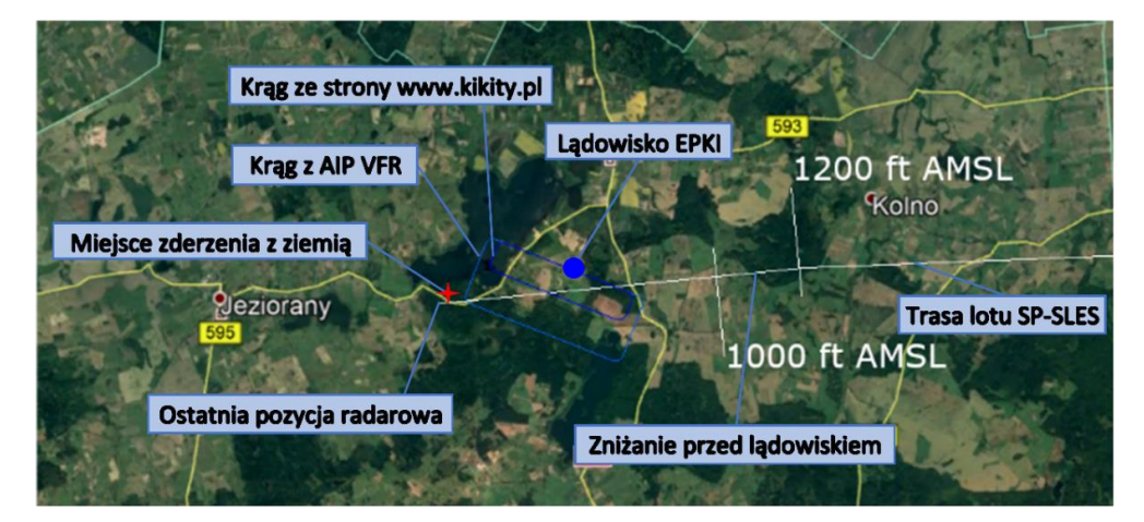
Fig. 1 Final portion of the flight path based on a radar screenshot [source: PKBWL<sup>1</sup>]