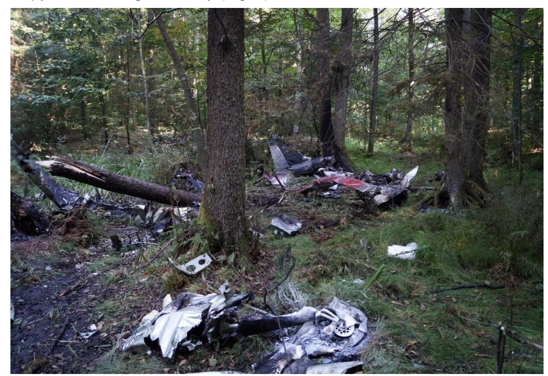
Fig. 2 Accident site and wreckage

After colliding with the ground, the plane broke into many parts, and the spilled fuel was ignited, causing a fire at the scene of the accident. For this reason, it was not possible to determine the type and amount of fuel on board the aircraft, however, when assessing the area covered by the fire, it may be assumed that at the time of the accident the quantity of fuel in the aircraft tanks was sufficient to continue the flight towards the aerodrome and land. The elements of the plane were scattered over a large area, some were hung on nearby trees, which may indicate that the destruction of the plane began at the moment of its contact with trees. When the plane crashed into the ground, a fire occurred, but went out by itself, because the plane fell in a swampy area with high humidity (Fig. 2).