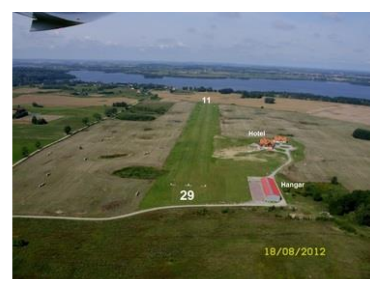
Fig. 5 EPKI Aerodrome

The general view of the aerodrome is shown in Fig. 5.