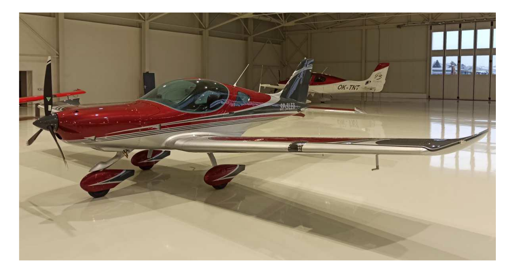
Fig. 3 Bristell S-LSA aircraft, SP-SLES